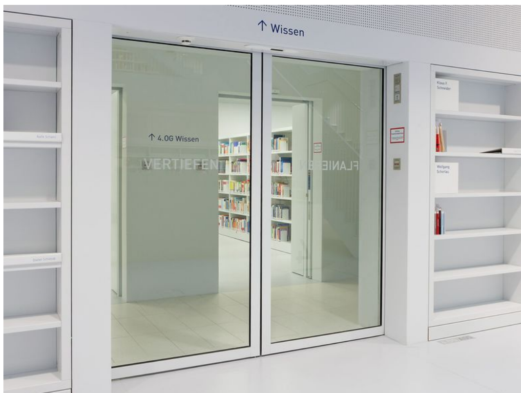
Automatic sliding door system for fire protection doors with resistance class T30