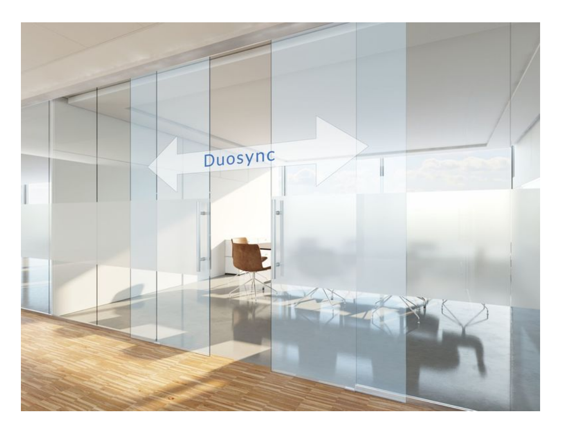
Sliding door fitting for double leaf synchronous opening glass doors with 140 kg leaf weight